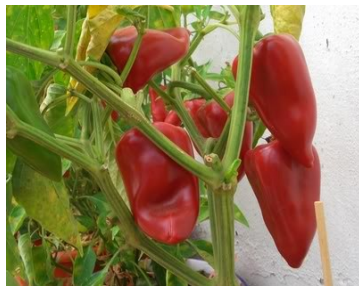
CHILE ROJO DE NUEVO MEXICO