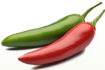
JALAPEÑO Y CHIPOTLE