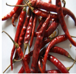
CHILE DE ARBOL