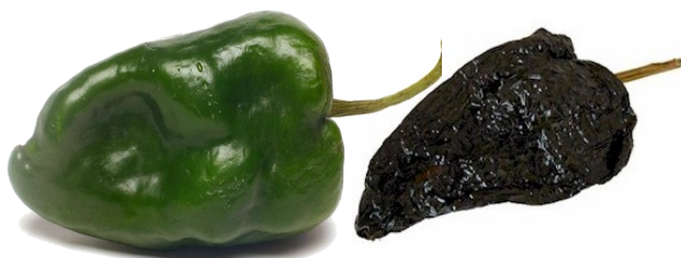
CHILE ANCHO (poblano-pasilla)