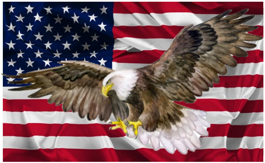
The bald eagle is the national bird of America.