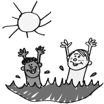
They swim in the Atlantic.