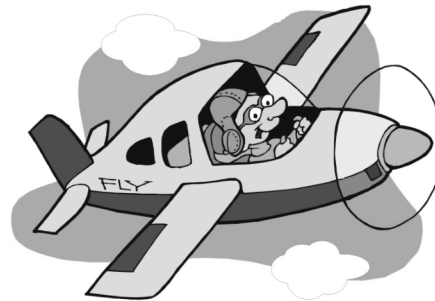
The plane flies high.