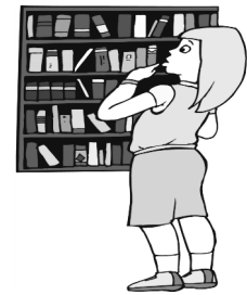
I like to go to the National Library of Mexico.