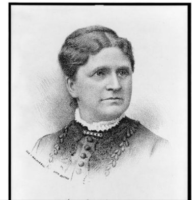
November 1744 – October 1818

2. Abigail Adams loved to read _____ books.