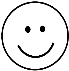
A perfect day