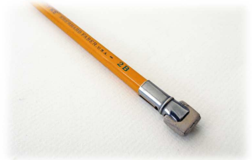
Early Pencil Eraser

Around 1844, Charles Goodyear, an American inventor, developed the process of vulcanization, which by heating rubber with sulfur made it harder, less sticky, and more durable.