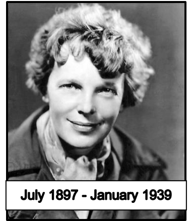
July 1897 - January 1939

Amelia soon took flight lessons in California and quickly became a skilled pilot. In 1920, Amelia bought her first plane naming it "The Canary." After just two years of flying planes, she was already attempting to break records. Amelia broke the woman's altitude record of 14,000 feet, became the first woman to fly solo across the Atlantic Ocean, broke speed records, and was the first woman to fly solo coast to coast. Amelia Earhart was also involved with many activities outside of flying airplanes. She published her own book, was the aviation editor of Cosmopolitan Magazine, and even